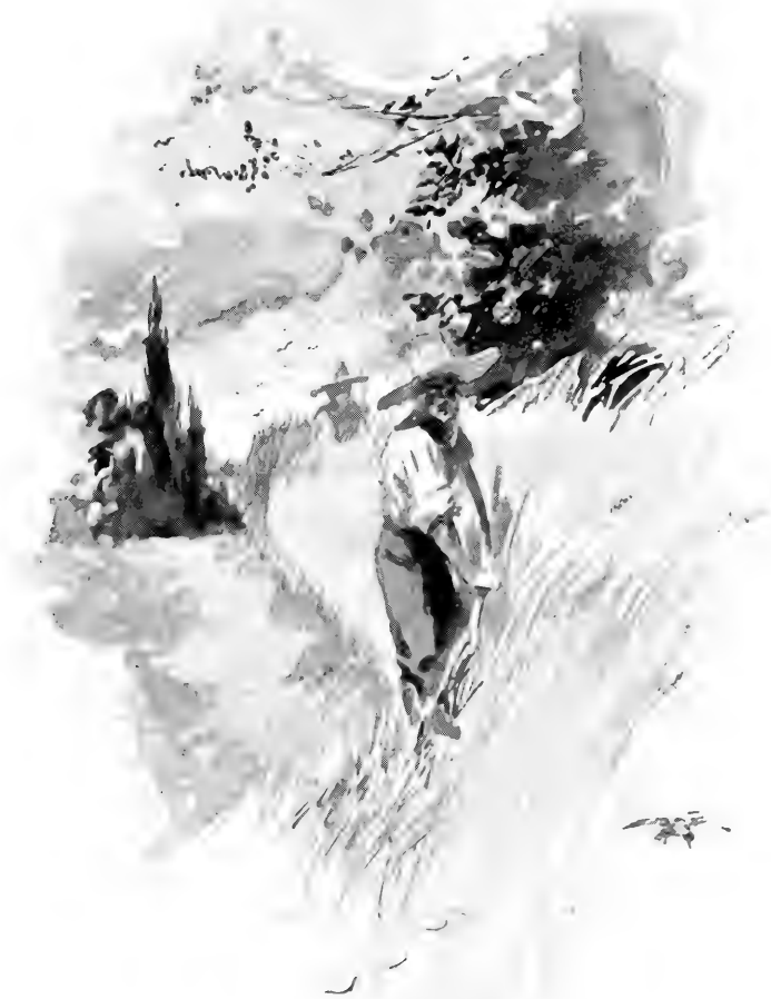
"THE FARMER SWUNG THE SCYTHE."—Page 67.